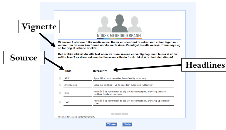
Figure 3. Experimental Design. This figure illustrates the experimental design for the Selective Exposure Study conjoint experiment.